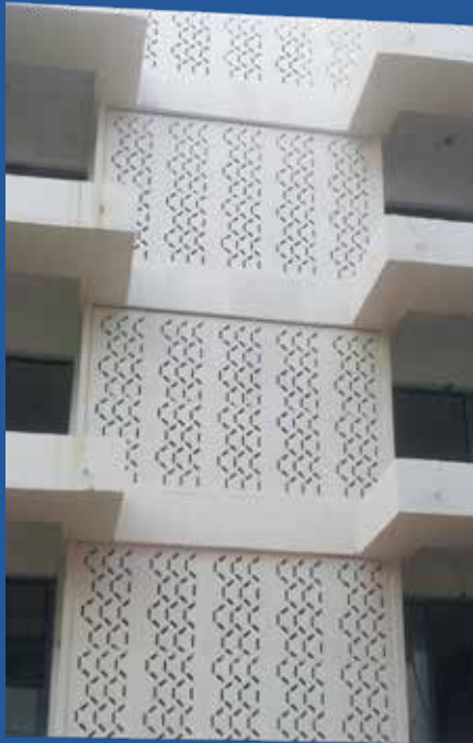
Cement Sheet Elevation