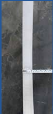
WJ Aluminium Part