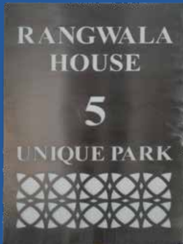
Steel Name Plate With Light