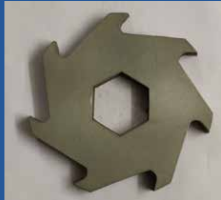
WJ Steel Cutter