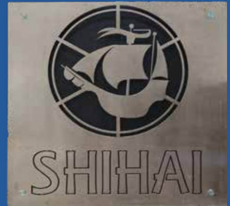
Copper Name Plate