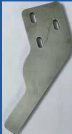
WJ Steel Part