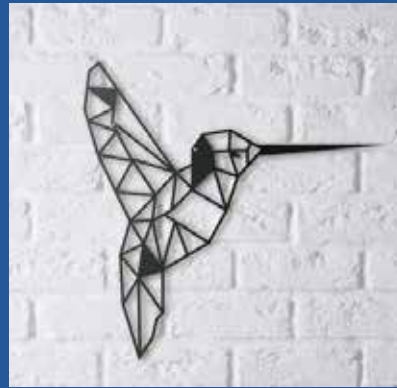
Metal Wall Mural