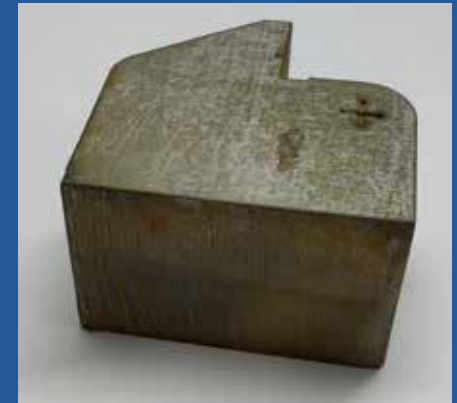
WJ Metal Part