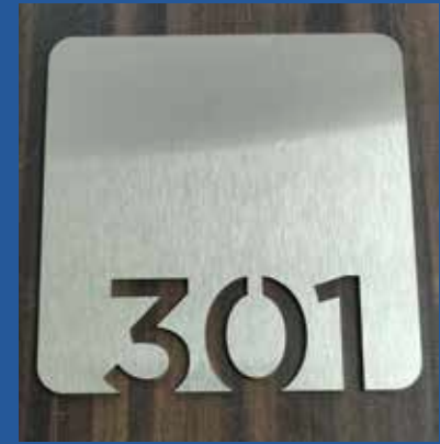
Steel Number Plate